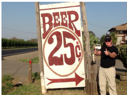
25c beer at Merced