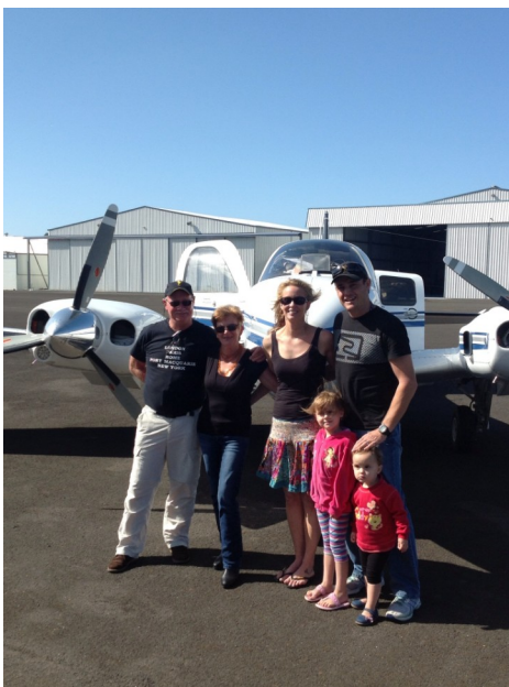
'58TT' and crew back home in Port Macquarie

We had bought a bunch of little $5 dollar koala bears at Sydney airport to give away on our travels. One remained, and he was named Charlie. This was a very clever little bear who helped program the GPS, and knew how to use the auto pilot and radios!! On getting airborne from Kiribati, we discovered that we had a stowaway on board in the form of another of these little Koalas. She was named Mrs Charlie, and had a gammy eye! These two had us in fits of laughter for many hours as they fought over Twisties, lollies, did bungee jumps on rubber bands, and generally misbehaved. No, you don't have to be mad to cross the Pacific in a light aircraft, but it sure helps.