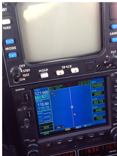
Crossing the equator

The first leg took us through North Carolina and Tennessee to West Memphis Municipal Airport. CTAF procedures apply at this airfield, and are identical to Australia. We spent an amazing afternoon going around Gracelands, Elvis Presley's home, and also went on board his privately-owned Convair 880 airliner, the 'Lisa Marie', which Elvis used regularly when on tour. The aircraft was complete with a bedroom, business centre and gold plated seat belts! The fin of the Convair was painted with Elvis's trademark lightning bolt, and the initials TCB, Takin Care of Business. Also on display was the famous pink Cadillac Elvis bought for his Mum. Sadly, we needed to push on, and flew across Arkansas to Fort Smith for the first night stop.