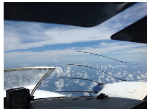
View across the Pacific

Some six hours short of Hawaii, we ran into another fairly serious problem when the fuel in the nose locker failed to transfer. Although we had sufficient fuel on board, this fuel was unusable as long as it was trapped in the nose. It now looked like we were only barely going to make Hawaii.