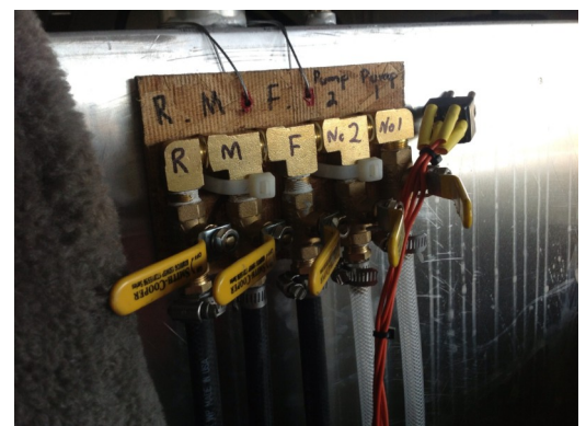
Ferry fuel control panel