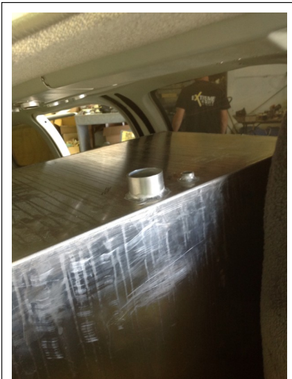
Long range fuel tank installed

The transpacific route we selected has been used for many years by the majority of ferry flights bound for Australia, the tracking taking us from the west coast of America to Hawaii, then south west via Samoa /Fiji/Noumea to the Australian mainland. The most critical of these legs is over to Hawaii, a distance of 2,200 nm, as there is no land between these two points.