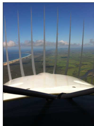
A recent photo I took in the Eurofox coming back from SWR, PMQ in the distance. Ed Godschalk

NOTICE OF 2013 ANNUAL GENERAL MEETING to be held on Wednesday 21st August 2013 at 7pm at the Clubhouse, Port Macquarie Airport