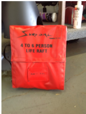
Just in case

We had to establish the correct fuel transfer sequence, and to this end, the fuel gauges were very carefully calibrated during our initial flight across the States. This sequence and timing was absolutely critical to ensure that we never overfilled the right wing tanks during fuel transfer, thus ending up in a situation whereby this fuel was vented overboard into the Pacific Ocean. Fairly recently, a Cessna 310 with the identical set-up to ours, did exactly that, and had to ditch well short of Hawaii on the way to Australia when it ran out of fuel. Oil consumption was also closely monitored to ensure there was always enough in the engines to safely cross the ocean.