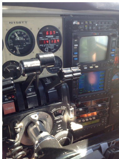
View from the left seat