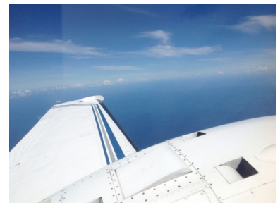
I spy with my little eye— something beginning with 'W'

On the human side of the flight, we were usually kept quite busy maintaining the nav log, making position reports and 'ops normal' calls, as well as scrupulously recording the fuel transfer sequences. Quieter moments were passed by playing 'I spy', usually going along the lines of "I spy with my little eye something beginning with W!!!"