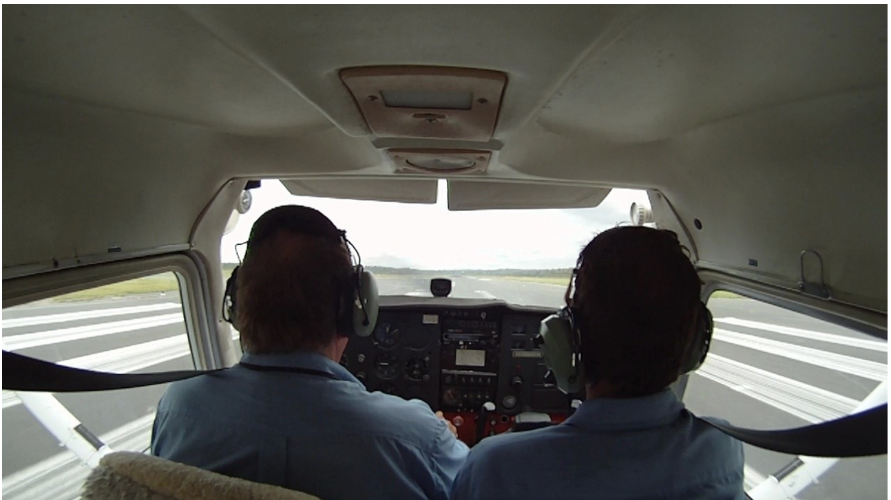
GUESS WHO (Answer on Page 9)