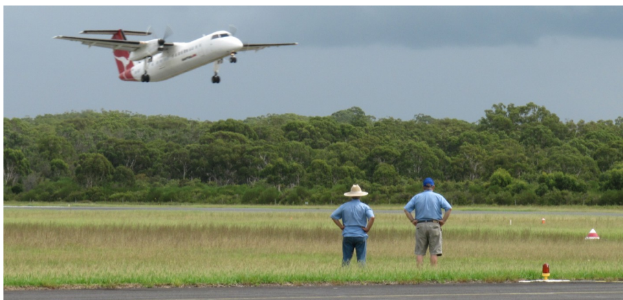
March 2011 competition day