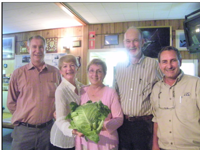
Not every team can win but, at least the Fly By Nights completed the whole course—unlike others who skipped bits or came home early when the going got tough!