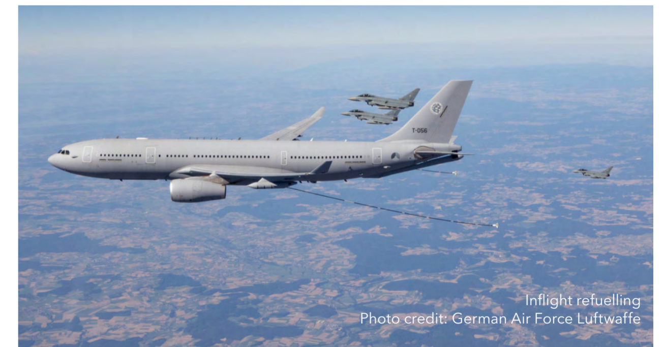
Inflight refuelling