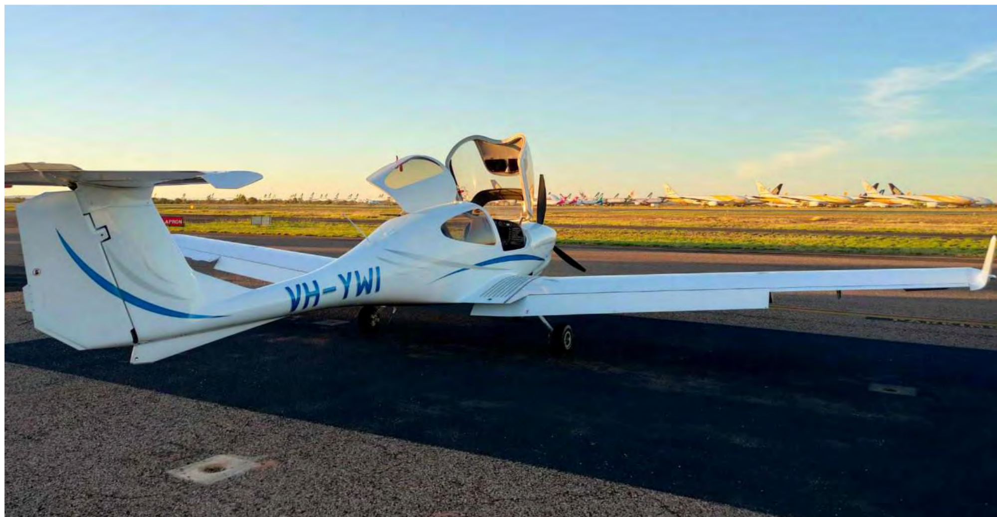
Check out AIAC Diamond fleet

As aviation businesses start opening up again these positions will again open. There is a hole now for younger pilots to move into. "I think the future looks really good, provided we can keep a lid on all of these lockdowns and we can keep borders open and people flowing through airports," Ged said.