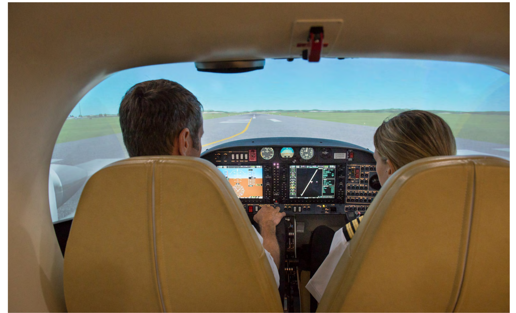
Training on the flight simulator

Ged told us, "The student number is due to the reality of a single runway and the infrastructure that we've got. Plus, we're living in an environment now where accommodation is scarce in town as well."