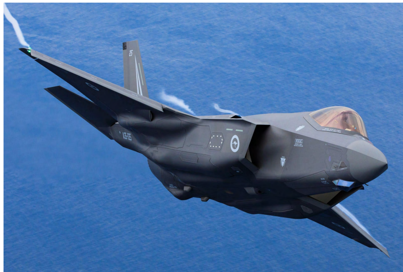
RAAF F-35A Lightning II A35-025.

Australia deployed its F-35A Lightning II fighter aircraft at Pitch Black 2022 for the first time.