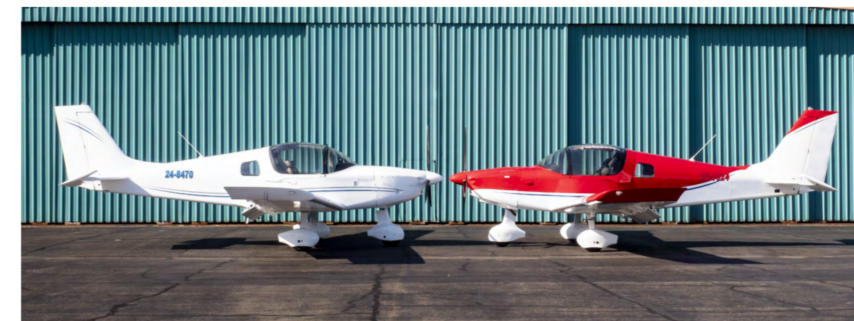
Sling - $150/hour ($180/hour for non-members) plus $5/hour fuel surcharge