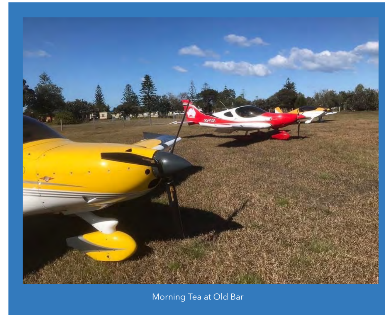
Morning Tea at Old Bar