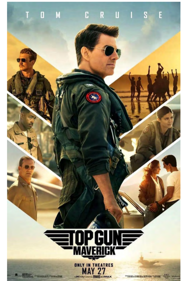
About 70 members, friends and families attended the movie premiere Top Gun Maverick on 26th May 2022 with many of us leaving Laurieton Plaza Cinema high on adrenaline afterwards.