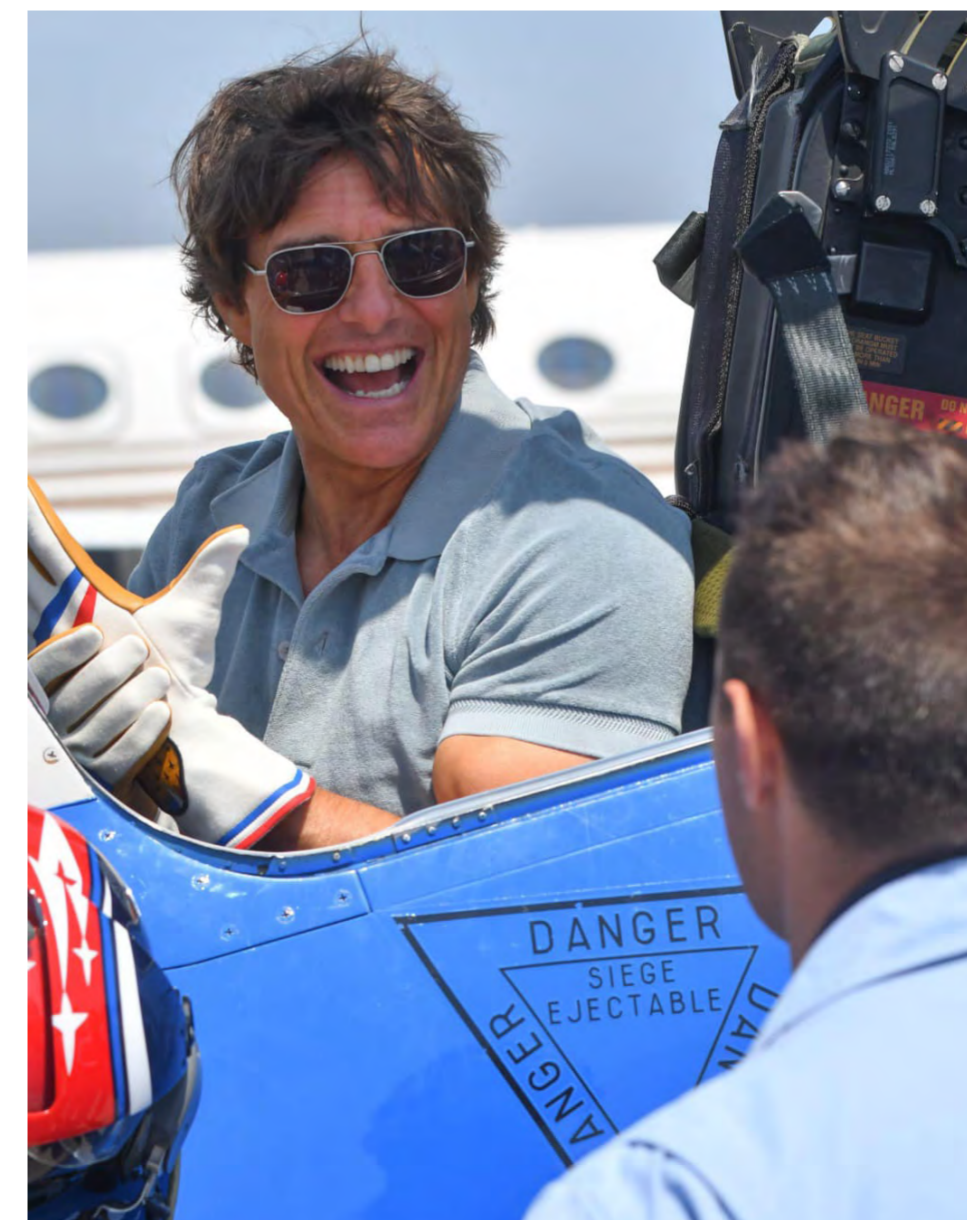
TOM CRUISE VISITS THE PATROUILLE DE FRANCE (THE FRENCH AIR FORCE FORMATION CREW, LIKE THE ROULETTES IN AUSTRALIA)