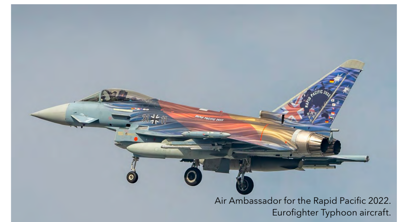
Air Ambassador for the Rapid Pacific 2022. Eurofighter Typhoon aircraft.